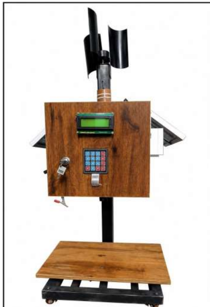
Fig no 1: Actual model

The Portable Solar & Wind Laptop & Mobile Charging System is a hybrid renewable-energy-powered charging solution developed to provide stable and efficient AC and DC power for charging multiple electronic devices. The system combines solar and wind energy sources to ensure continuous power generation under different environmental conditions. Solar energy is collected using two 12V, 10W solar panels, while wind energy is generated through a compact wind turbine using a 12V DC gear motor with PVC blades. The generated energy is controlled and stored in a 12V, 12Ah rechargeable battery using a charge controller, which helps maintain safe and efficient battery charging and discharging operations.