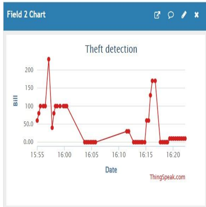
Fig5.2(b) Billing Graph

Field 3 represents the power supply status, which confirms stable system operation during the testing phase.