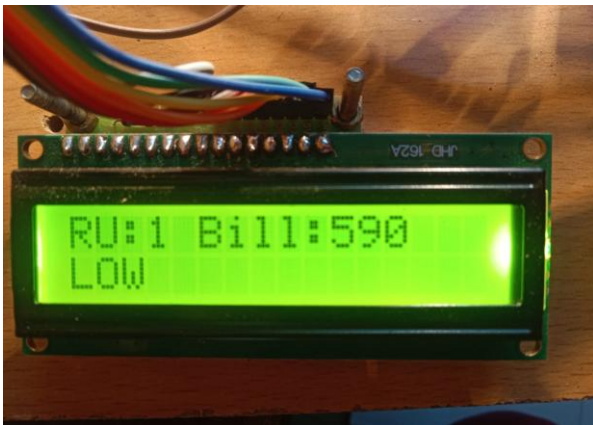
Fig5.1(B)LCD showing low balance warning

The system also provides warning messages when abnormal conditions occur. When the prepaid balance approaches the minimum threshold, a low-balance warning is displayed to notify the consumer. This ensures that users are informed about their remaining energy credits in advance.