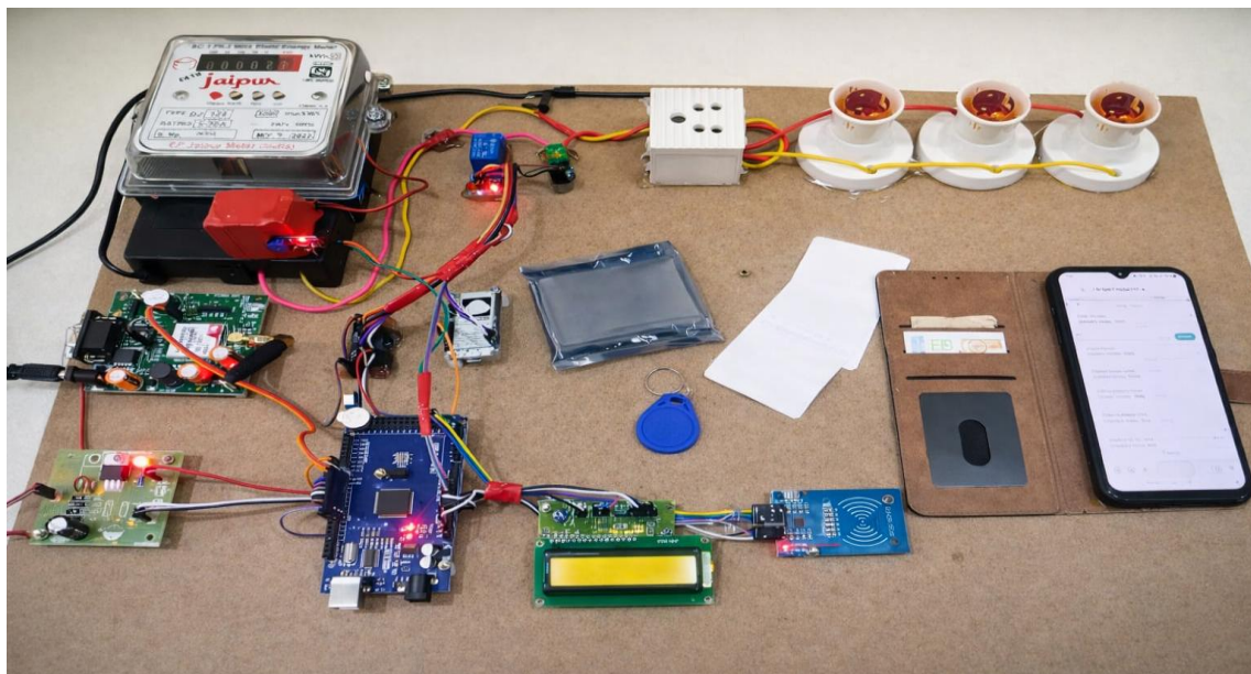
fig.5.1 project view

The proposed IoT-based Smart Energy Theft Detection System using Current Imbalance Alerts and Prepaid Billing was implemented and tested to evaluate its performance in real-time energy monitoring, theft detection, and prepaid billing management. The system integrates current sensors, a microcontroller, an LCD interface, and IoT cloud connectivity for data visualization and monitoring.