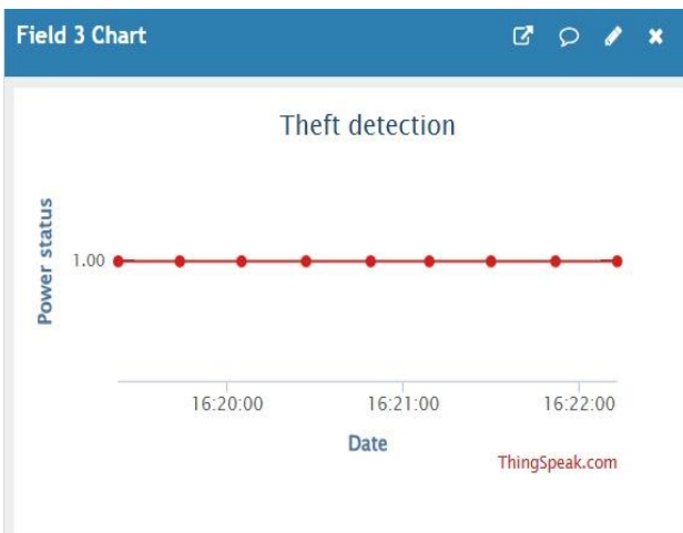
Fig5.2(c) Power Status graph

Field 4 indicates the theft detection status, where the value 0 represents normal operation and 1 indicates a detected tampering or theft event. The graph shows instances where the system successfully identified abnormal current conditions corresponding to simulated electricity theft scenarios.