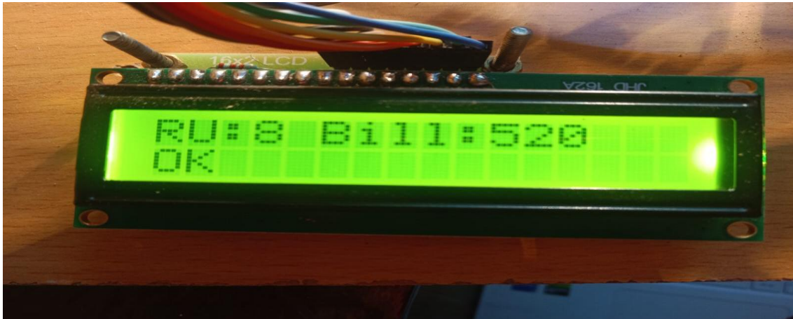
Fig 5.1(A) LCD displaying remaining balance / billing values)

The system also provides warning messages when abnormal conditions occur. When the prepaid balance approaches the minimum threshold, a low-balance warning is displayed to notify the consumer. This ensures that users are informed about their remaining energy credits in advance.