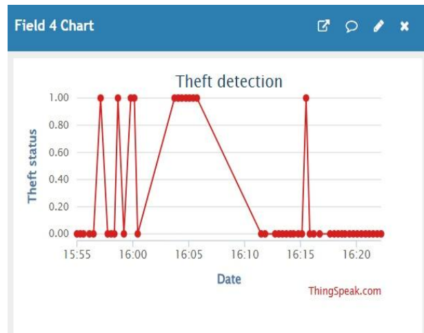
Fig5.2(d) Theft detection graph