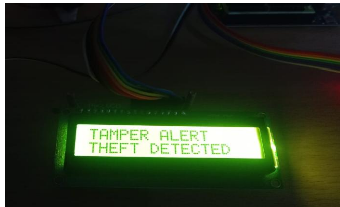
Fig5.1(C) LCD displaying tamper alert / theft detected

To evaluate theft detection capability, a current imbalance was intentionally introduced between the supply and load paths. When the difference exceeded the predefined threshold, the system immediately detected the abnormal condition and displayed the message “TAMPER ALERT – THEFT DETECTED.” This confirms the effectiveness of the current-comparison method used for identifying unauthorized electricity usage.