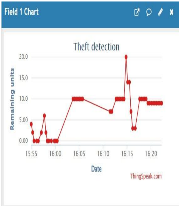
Fig5.2(a) Remaining Units Graph