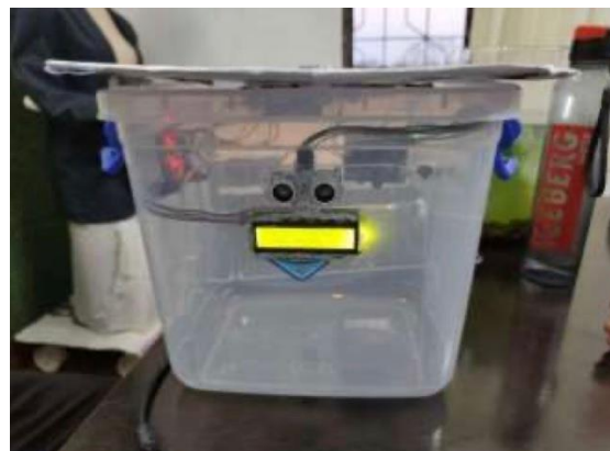
Fig2.1: Hardware Result

When both modules were tested together, the integrated system functioned seamlessly, providing real-time monitoring, alerts, and actionable information for both waste management and manhole safety. The overall results indicated a significant reduction in manual inspection efforts by nearly 60%, ensuring efficient resource utilization. Overflowing bins were avoided through timely alerts, and open manholes were detected immediately, improving public safety. Data collected from both systems allowed for trend analysis, enabling better planning of waste collection schedules and maintenance operations. In conclusion, the testing demonstrated that the proposed system is accurate, reliable, and scalable, making it suitable for real-world deployment in smart city environments to enhance urban sanitation and safety.