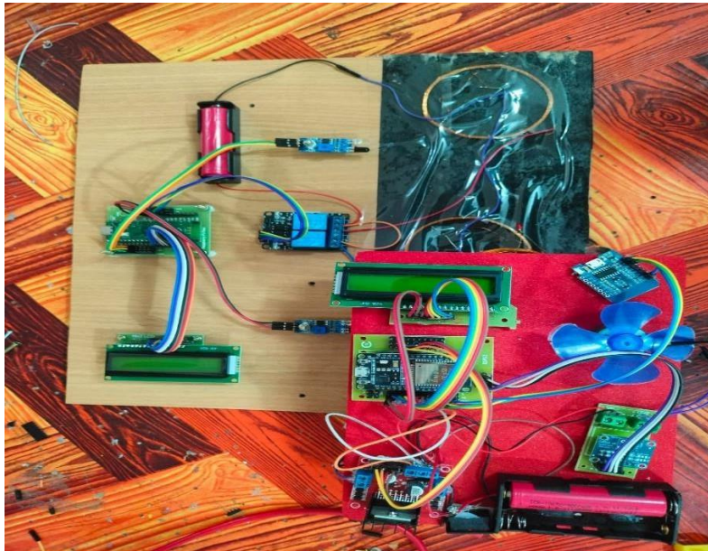
Fig2: Hardware Arrangement

battery's charge level, displaying real-time data on the LCD screen, while the LED indicator shows the charging status.