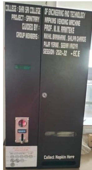
Fig -5: Sanitary Vending Machine

the rotation mechanism of the DC motor working motor and also the associated load ensures that proper operation takes place and also the item is vended properly. The pad being dispensed is created to fall on the infra-red sensor. because the object cuts the infrared rays, we will say that the method is complete and rotation of motor stops. If the item isn't dispensed out and if there's no obstruction sensed by the sensor, then it's assumed that there's some problem within the system.