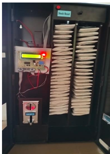
Fig -6: Set Up Overview