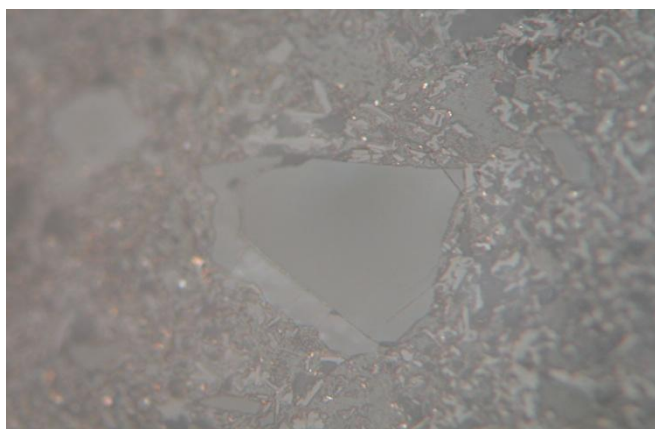
Fig. 2 Showing microcrack in the grain boundary region of large quartz grain of 45 \mu\text{m} size. Note microcracks are detected in the rim of 30 \mu\text{m} size quartz grain, PhD Thesis J. Liebermann