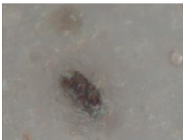
Fig.3 Dark region of porcelain matrix in the insulator part retrieved from a low strength insulator after 15 years of life. Damage in the surrounding area is suspected due to contamination

A new glaze composition has been developed for hydrophobicity. Details will be presented elsewhere. Alternatively silicone grease or RTV coating can be employed 10 .