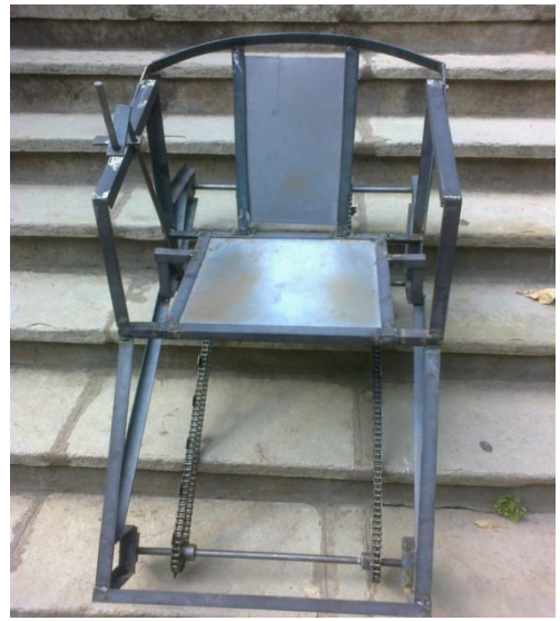
Fig.1. working model of stair climbing wheel-chair

The chain has nubs that aid traction to keep the wheelchair from sliding downward during climbing. The power is transmitted by the rotation of the handle connected by the rod. The rotation of the rod is transmitted to the middle shaft with the use of worm and worm wheel gear. Hence the chain rotates. Wheel chair is designed such that, it climbs the stairs backwards so that person sitting on the wheel chair feels comfortable even at the middle of the steps.