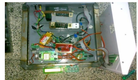
Fig 4: Prototype of smart gas cylinder

The system prototype is constructed and when a system sensor detects the leakage and sends the SMS to housemates and activates the alarm and switches on the exhaust fan, turns off the power supply. Also system prototype continuously monitors the LPG level of the cylinder and books the cylinder automatically.