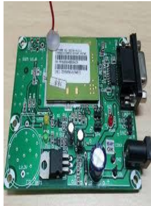
Fig4. GSM Module

These GSM modems are most frequently used to provide mobile Internet connectivity, many of them can also be used for sending and receiving SMS. GSM modem must support an “extended AT command set” for sending/receiving SMS messages. It works on frequencies EGSM 900 MHz, DCS 1800 MHz and PCS 1900 MHz. Designed for global market, SIM300 is a Tri-band GSM/GPRS engine that works on frequencies EGSM 900 MHz, DCS 1800 MHz and PCS1900 MHz. SIM300 provides GPRS multi-slot class 10 capability and support the GPRS coding schemes CS-1, CS-2, CS-3 and CS-4.