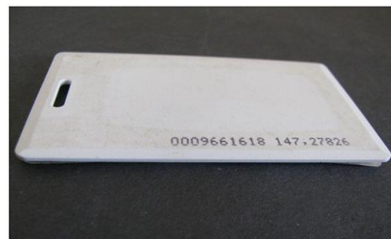
Fig4. RFID Tag

It is made up of carbonic structure which contains magnetic strip or coil layer inside the tag which helps in sensing the tag. When radio waves from the reader are encountered by a passive RFID tag, the coiled antenna within the tag forms a magnetic field. The tag draws power from it, energizing the circuits in the tag. The tag then sends the information encoded in the tag's memory. The tag is typically much less expensive to manufacture.