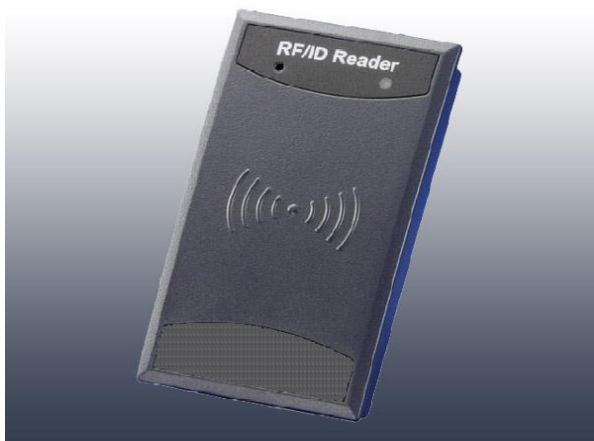
Fig 5. RFID Reader

Readers come in many forms, operate on different frequencies, and may offer a wide range of functionality. Readers may have their own processing power and internal storage and may offer network connectivity. RFID readers are used to interrogate data stored in tags. It contains radio frequency module, control unit and an antenna to interrogate electronics tags via radio signals. The antenna inside the reader generates electromagnetic field. When a tag passes through the field, the information stored on the chip in the tag is interpreted by the reader and sent to the server, which, in turn, stores or retrieves information about the book's issue or return. RFID readers can be in any form either fixed or handheld. In this project both are in use. RFID readers are placed both at entry and exit of the library.