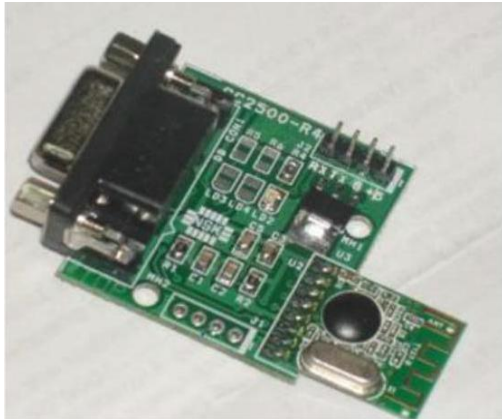
Fig 1. zig bee module

consumption (13.3 mA in RX, 250 kBaud, input well above sensitivity limit), Excellent receiver selectivity and blocking, Programmable data rate from 1.2 to 500 kBaud. It is Suitable for frequency hopping and multichannel systems due to a fast settling frequency synthesizer with 90 us settling time.