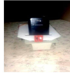
Fig. 3. Front view of the robot

The Fig. 2. Shows the top view of the designed robot assembly. In this robot the AVR development board is used as the navigation controller. A 12V battery is used as the power source.