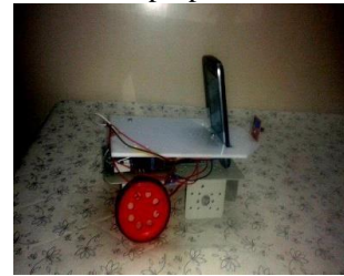
Fig. 4. Side view of the robot

Front view of the robot is shown in the Fig.3. The camera (in this case the mobile phone) is placed in front of the robot in order to capture the video. IR sensor is fixed at edge of the chassis for the purpose of obstacle detection.