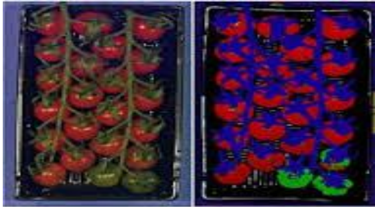
Fig1.RGB model of a colour image of ripe tomatoes

These tomatoes on undesired rows can be distinguished from desired tomatoes from distance of tomatoes from the point of acquisition of image. This can be deduced from comparison of tomato size with a certain threshold, as tomatoes farther away are smaller. Opening algorithm with reconstruction operation is used to meet this end. Reconstruction operation can be understood as a conditional dilation, where pixels of image are dilated only if corresponding pixel in the mask exists.