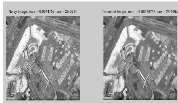
Fig. 2. Fast NLM filter performance analysis

The principle of SSI resembles the Integral image which has been used in the application of face detection. For each pixel in the image, the integral image will maintains the summed value of all the existing pixels in the upper left part of the given image. Like the definition of integral image, for each pixel it stores the summed square values in the upper left pixels. SSI can also be