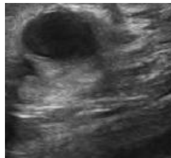
Fig.2. Benign mass

The ultrasound CAD system is evaluated fairly and correctly, based on the classifiers chosen. Thus the masses and microcalcifications are classified into benign and malignant. The performance of the CAD system is evaluated.