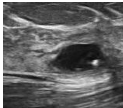
Fig.4. Benign microcalcification