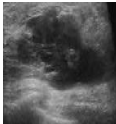
Fig.3. Malignant mass