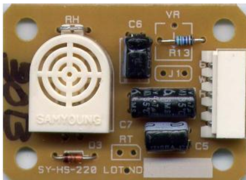
Fig 3: Humidity Sensor (SY-HS-220)

The humidity decides an amount of water molecules present in the air of poly-house environment. To evaluate the extent of humidity, amount of water molecules added/dissolved in the air of Poly-house environment, a smart humidity sensor SY-HS-220 is selected for the system. Figure shows an SY-HS-220 humidity sensor. The SY-HS-220 module comprised of sensing unit along with other signal conditioning part of the circuit, such as thermistor for temperature compensation. This is highly precise and reliable. It works with +5V power supply and current consumption is less than 3.0mA. The operating temperature range is 0-60 degree Celsius