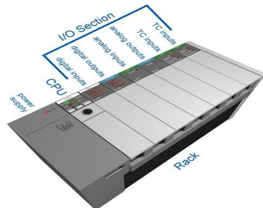
Fig.2: basic PLC structure

It works on 24V DC power supply. It has analog as well as digital inputs and outputs. It has memory to store the data. Its programming can be changed any time according to the need of crop.