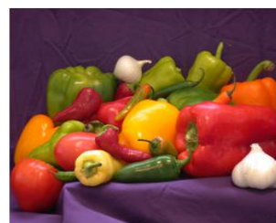
(a) Input Image

Guided filter is fast and accurate filter. Guided Filter gives smoothen image and enhanced image. Guided Filter algorithm is simulated in MATLAB which is shown in Fig.1. Smoothen and enhance image. Guided filter gives the higher quality image.