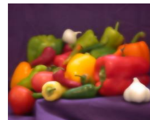
(b) Smoothen Image