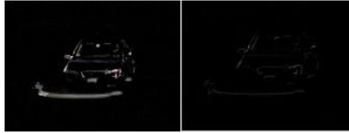
Fig. 6. (a) Frame differenced image (b) Difference of Gaussian filtered image of frame differenced image

By using Difference of Gaussian method noise is less as compared to Gradient method because of smoothing by Gaussian filter. Fig.5. and Fig.6. shows the output of the proposed method by using other input data.