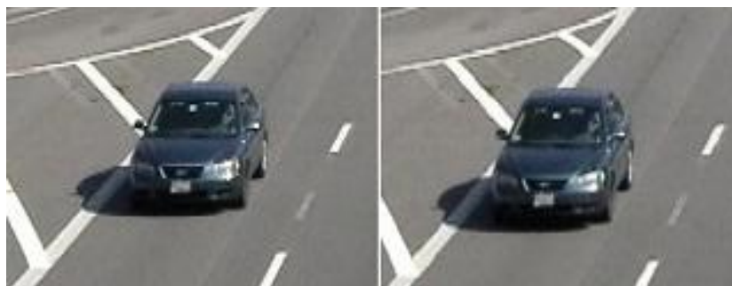
Fig. 5. Different frames in the input video (a) Frame 784, (b) Frame 785