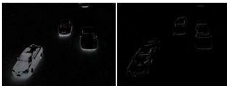
Fig. 4. (a) Frame differenced image (b) Difference of Gaussian filtered image of frame differenced image