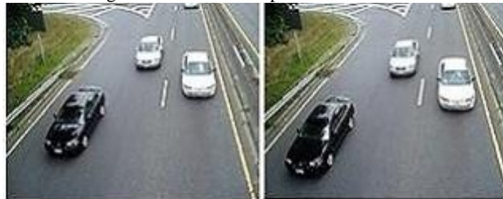
Fig. 3. Different frames in the input video (a) Frame 71, (b) Frame 72