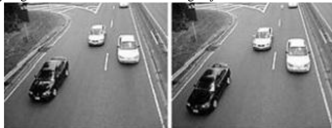
Fig. 1. Different frames in the input video (a) Frame 71, (b) Frame 72 (Grey level)