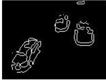
(c) Laplacian of Gaussian of Frame differenced image.