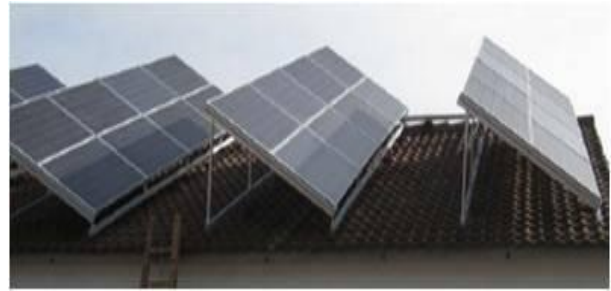
Fig. 1(b) Shading due to nearby PV panels [www.solaredge.comarticlespv-system-shading]