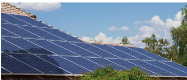
Fig. 1 a) Shading due to nearby tree [www.homepower.comarticlessolar-electricitydesign-installationenergy-basics-shading-and-solar-electric-systems]

Generation of power through solar photovoltaic system depends upon various condition as insolation, temperature and shading condition. Due to increasing electricity price it is being often solar photovoltaic is placed on the rooftop of buildings[5]. For high voltage and current requirement photovoltaic cells are connected in series and parallel configuration. Output power from these configuration reduces due to shades on these photovoltaic cells. Shading can be categorized as easy-to-predict or difficult-to-predict. Easy-to-predict shades can be due to tree shown in fig. 1(a), due to near by panel shown in fig. 1(b), chimney, near by building, pole shown in fig. 1(c). Difficult-to-predict shades can be due to moving clouds[5], snow and dust in the vicinity of the photovoltaic array. Hence, effect of fluctuations in photovoltaic power have studied by some researchers[3]. It has studied that shading on photovoltaic due to passing clouds fluctuates power generation and affects the performance to which it is connected. Shading due to difficult - to - predict i.e. moving clouds has financial impact on utility[5]. The effect of size i.e. number of modules not only affects the performance but also the configuration of solar photovoltaic array significantly affects power output under partially shaded conditions.