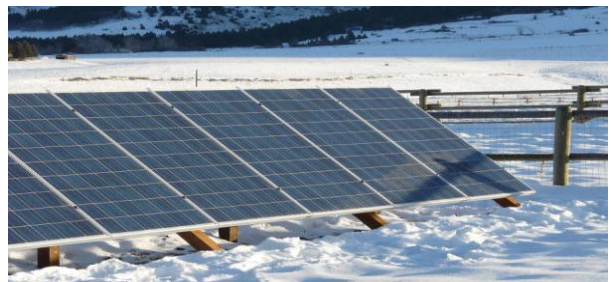
Fig. 1(c) Shading due to pole [www.builditsolar.comProjectsPVENphasePVShading.htm]

Many techniques are explained to mitigate the effect of partial shading and explained as under: